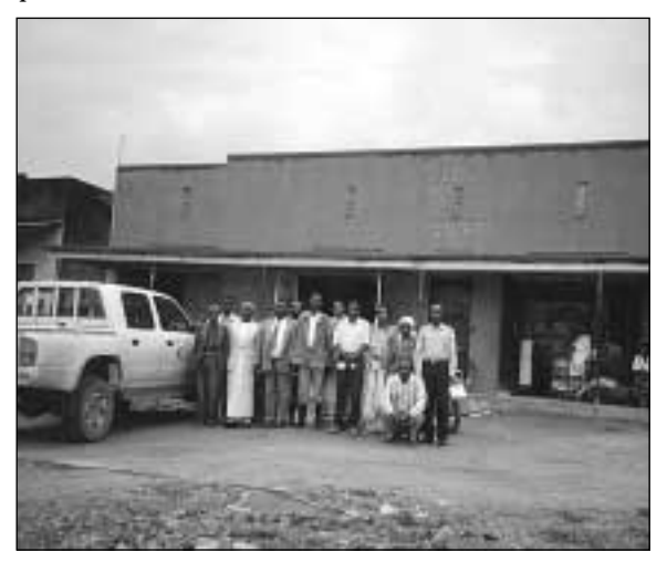
Kiteesa Growers' Coop Committee at their new store and commercial unit in the Kyotera township, built with assistance from the IFCD project in Uganda.

IFCD's first project at Rakai District in Uganda, ran from October 1995 until September 1998 and was called the Co-operative and Rural Enterprise Programme (CoREP). A total of 22 existing local coffee co-operatives and 16 women's groups were targeted. Various training inputs were made including assistance with the development of a realistic plan of action for the future of each group. This included our matching of small capital savings, by the group members. The results were quite good and were enhanced by gaining support from the Food Security Project of USAID, which provided bean seeds for planting and market opportunity for surplus produce.