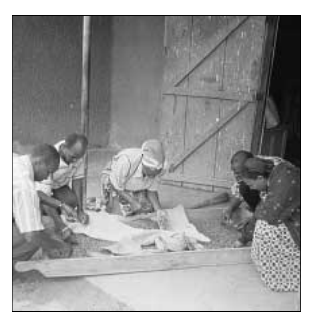
Sorting beans to market standard at the Kabagu Growers' Coop in Masaka District, part of the IFCD project in Uganda.

farmer in his Ugandan village. Prior to IFCD's intervention he would have harvested 400KG of beans from 1 acre of land. Now he has increased cultivation to 2 acres and is harvesting 1,500KG. The farm gate price for beans is 260/= per KG (about 141/2p). Through collective marketing he will realise 380/= per KG (21p - some 46% more). The total value of his harvest is therefore approximately £315 - prior to IFCD's intervention it would have been £58. While the value of the harvest may still seem low by European standards it should be remembered that GNP per capita in Uganda is only $200.