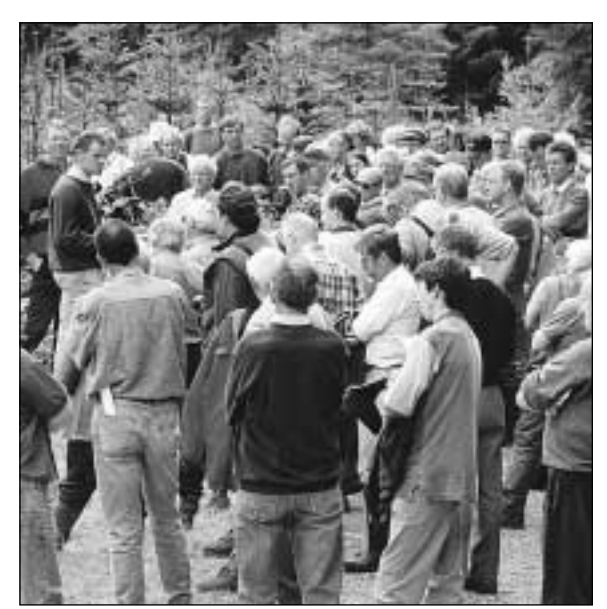
Attendance at an Irish Timber Growers Association Field Day.