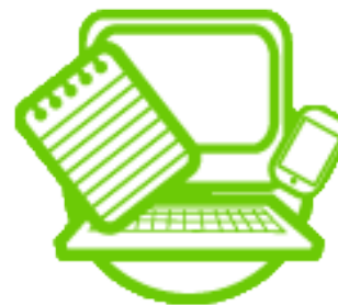
Advisory & education