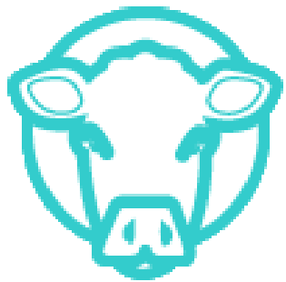
Livestock marketing, breeding & animal health

Starting from our agricultural roots and the vision of our founding President Sir Horace Plunkett in 1894, today ICOS has evolved to serve the co-operative sector in several categories: