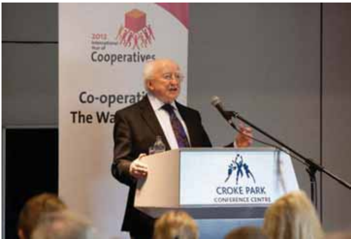
President of Ireland, Michael D Higgins speaking at 'Co-operatives the Way Forward' Seminar

The Plunkett Foundation organised a major international gathering of high level global co-operative leaders on Rural Development in Dunsany Castle, the ancestral home of Horace Plunkett, in which ICOS participated. A major declaration on the role of co-operatives in rural development internationally was agreed. The occasion of a conference, organised by GORTA on World Food Day in October, was used by ICOS to launch and publicise the declaration here in Ireland. ICOS staff made presentations on co-operative themes to a number of interest groups, and hosted co-operative visitors from Moldova and France.