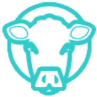
Livestock marketing, breeding & animal health

Starting from our agricultural roots and the vision of our founding President Sir Horace Plunkett in 1894, today ICOS has evolved to serve the co-operative sector in several categories: