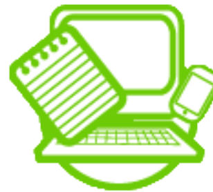
Advisory & education