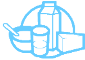
Multi purpose dairy