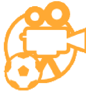
Community, media, culture, sport & leisure