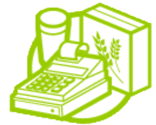
Store, trade & wholesale

Starting from our agricultural roots and the vision of our founding President Sir Horace Plunkett in 1894, today ICOS has evolved to serve the co-operative sector in several categories: