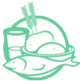
Food, fisheries & beverages